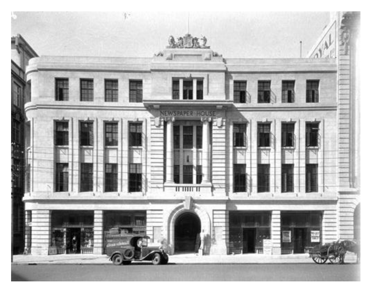
Newspaper House (1932) in St George's Terrace, Perth (SLWA 095206PD).